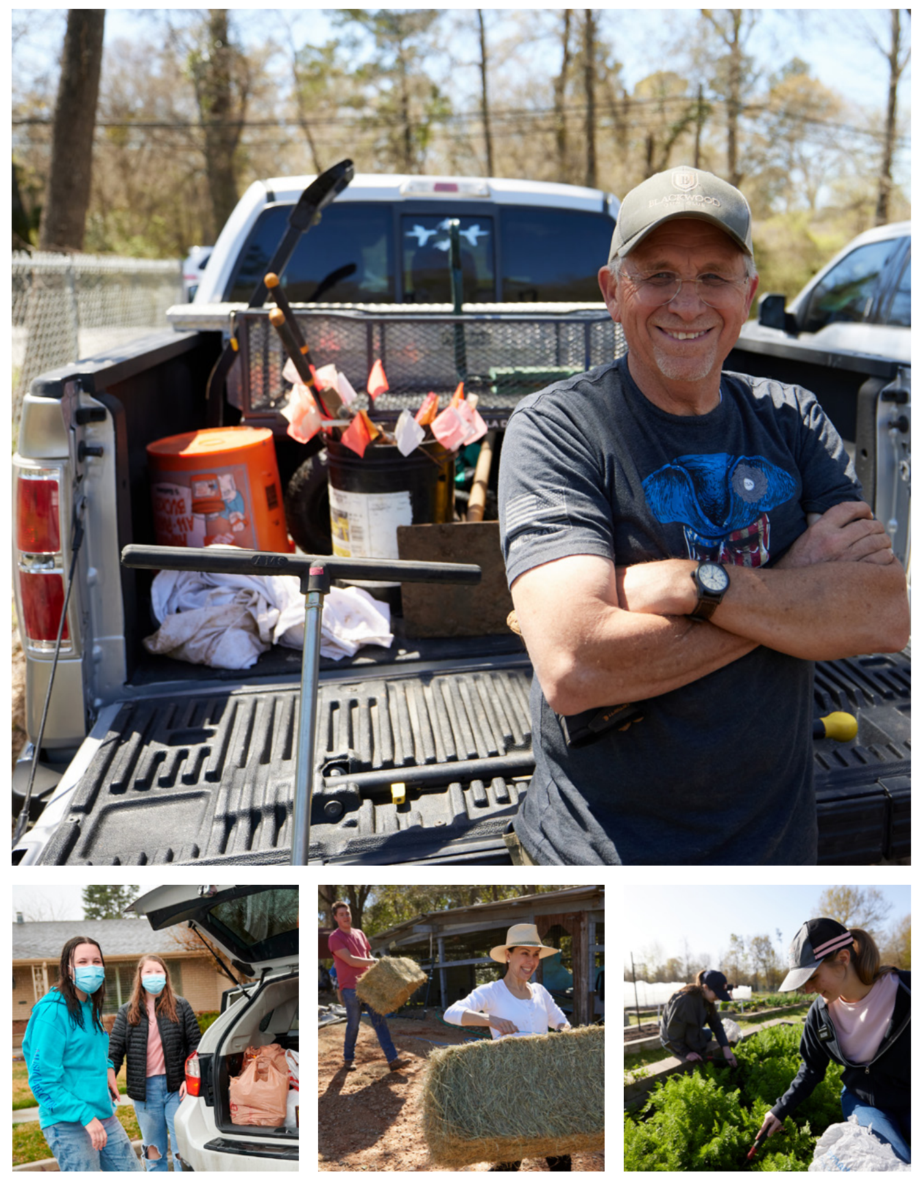
Bottom Left: The "Feed Utah" food drive collected thousands of food donations from around the state in less than a day.