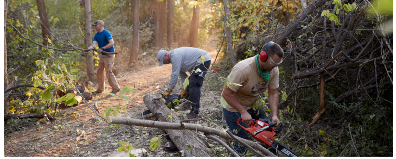
Above: Volunteers from a Church congregation in Kaysville, Utah gather firewood from storm-impacted areas. The firewood was then delivered to residents of the Navajo Nation.