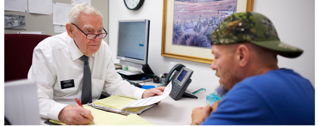
Above: The Church's Transitional Services works with those who require assistance with various needs, such as job search help and accessing local resources.