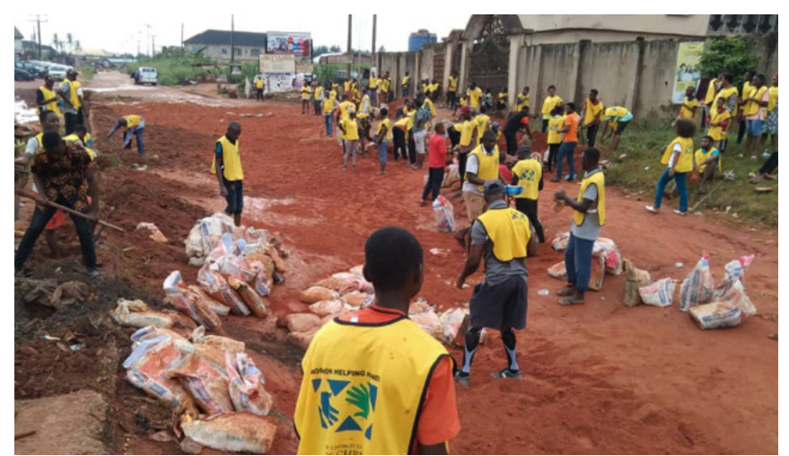
Above: Church members in Ghana organize to plant 15,000 seedlings for the 2021 All Africa Service Day.

IN BOLIVIA , the Relief Society sisters of the Los Andes Stake collected 34,000 plastic caps to support the Niño Feliz initiative, which helps low-income children with cancer receive chemotherapy treatments. And members of the Khovd branch in Mongolia visited their local Violence Victims' Shelter to donate warm blankets, newborn supplies, and hygiene kits.