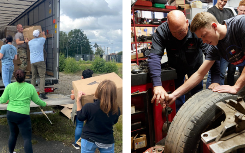
Bottom Left: At Ramstein Air Base in Germany, volunteers sort donations for individuals fleeing conflict in Afghanistan.