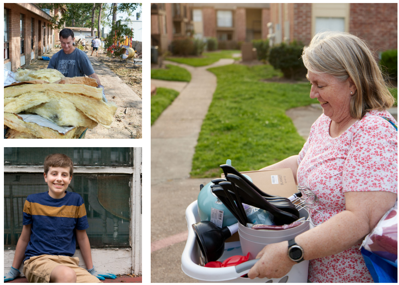
Top Left: Volunteers work alongside others to remove debris caused by Hurricane Ida at the First United Methodist Church in Hammond, Louisiana.