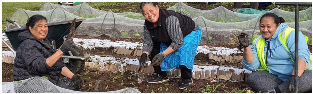
Above: Church members in Auckland, New Zealand, collaborate with other community organizations to weed gardens and beautify their community.

"Thou shalt love thy neighbor as thyself."