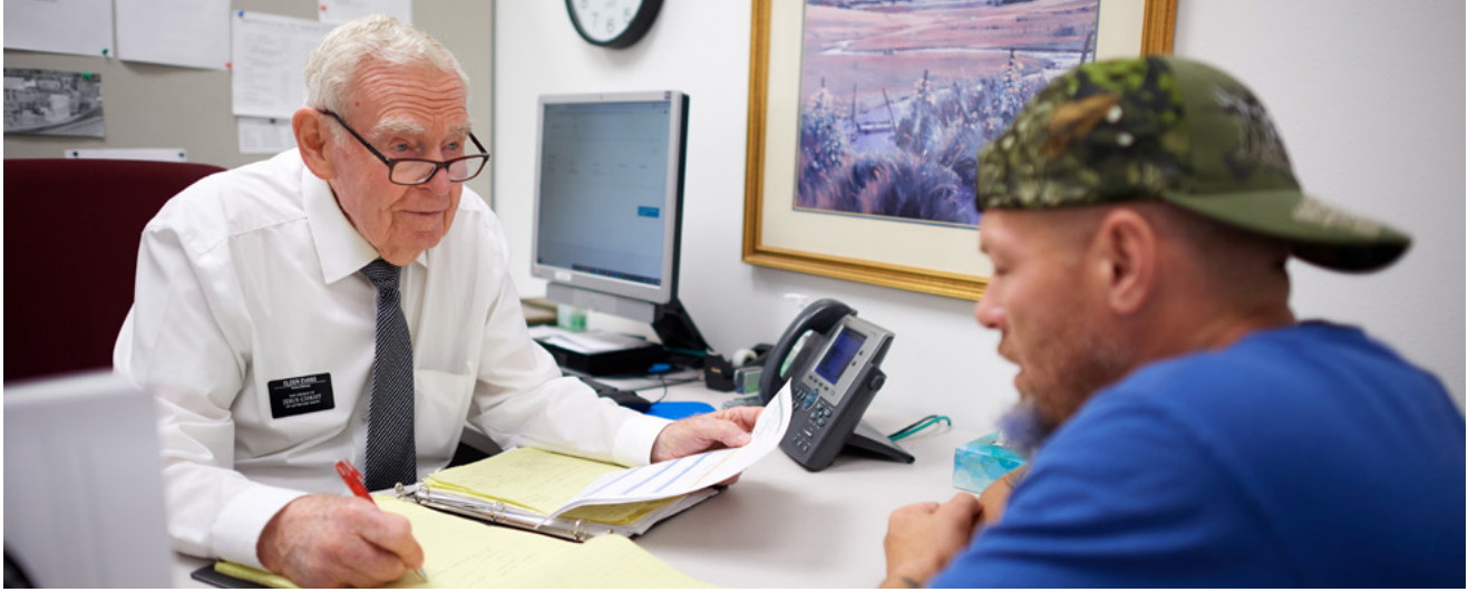
Above: The Church's Transitional Services works with those who require assistance with various needs, such as job search help and accessing local resources.