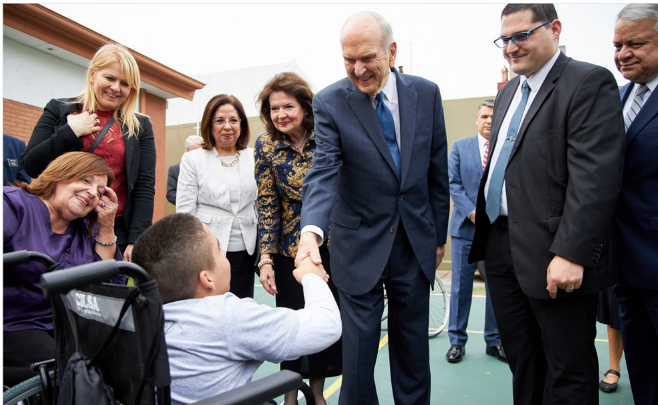
Above: During his Latin America ministry in 2019, President Russell M. Nelson attended a wheelchair distribution event in Argentina.