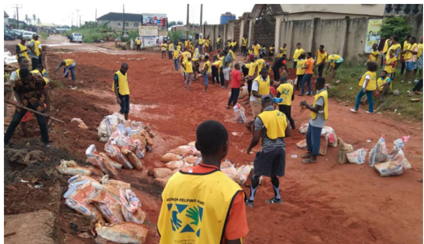
Above: Church members in Ghana organize to plant 15,000 seedlings for the 2021 All Africa Service Day.

IN BOLIVIA , the Relief Society sisters of the Los Andes Stake collected 34,000 plastic caps to support the Niño Feliz initiative, which helps low-income children with cancer receive chemotherapy treatments. And members of the Khovd branch in Mongolia visited their local Violence Victims’ Shelter to donate warm blankets, newborn supplies, and hygiene kits.