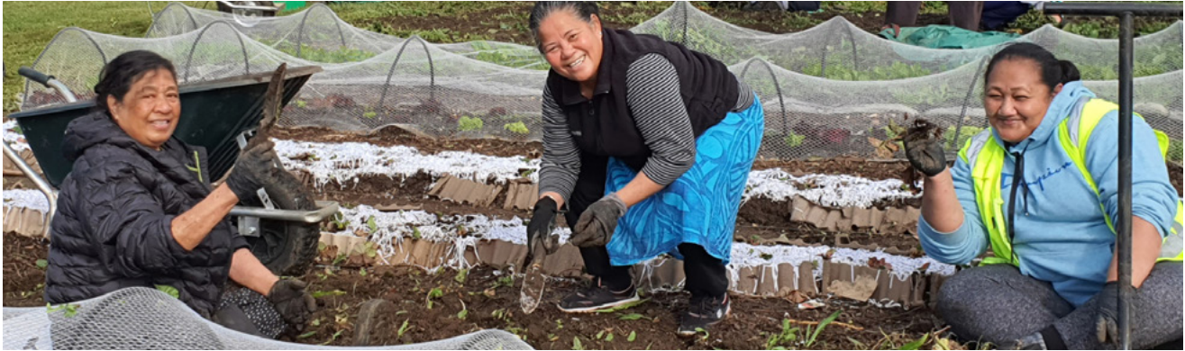
Above: Church members in Auckland, New Zealand, collaborate with other community organizations to weed gardens and beautify their community.

“Thou shalt love thy neighbor as thyself.”