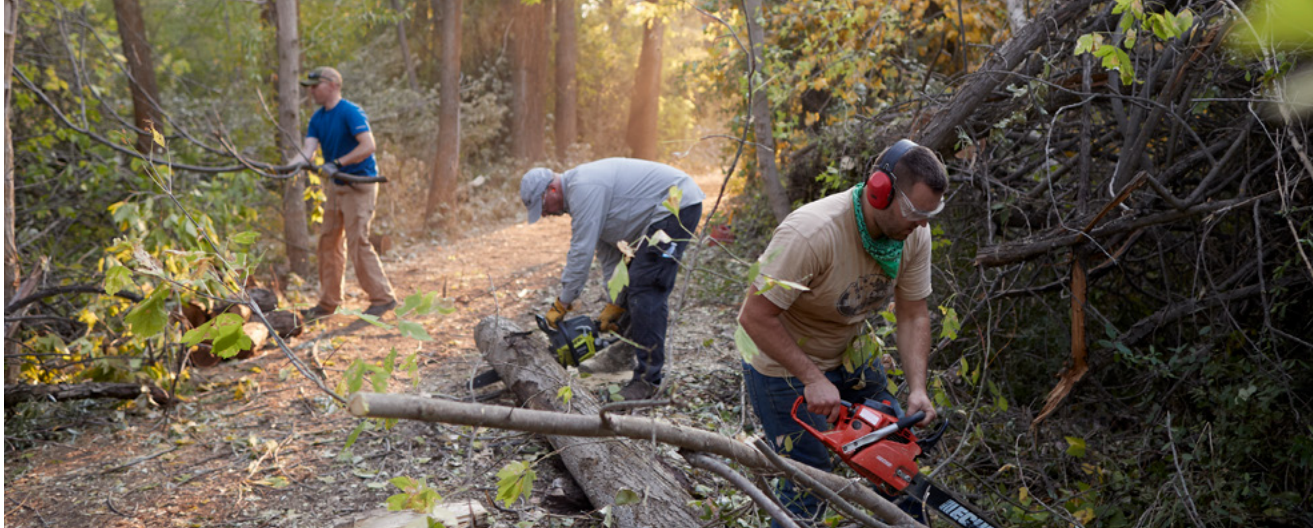
Above: Volunteers from a Church congregation in Kaysville, Utah gather firewood from storm-impacted areas. The firewood was then delivered to residents of the Navajo Nation.