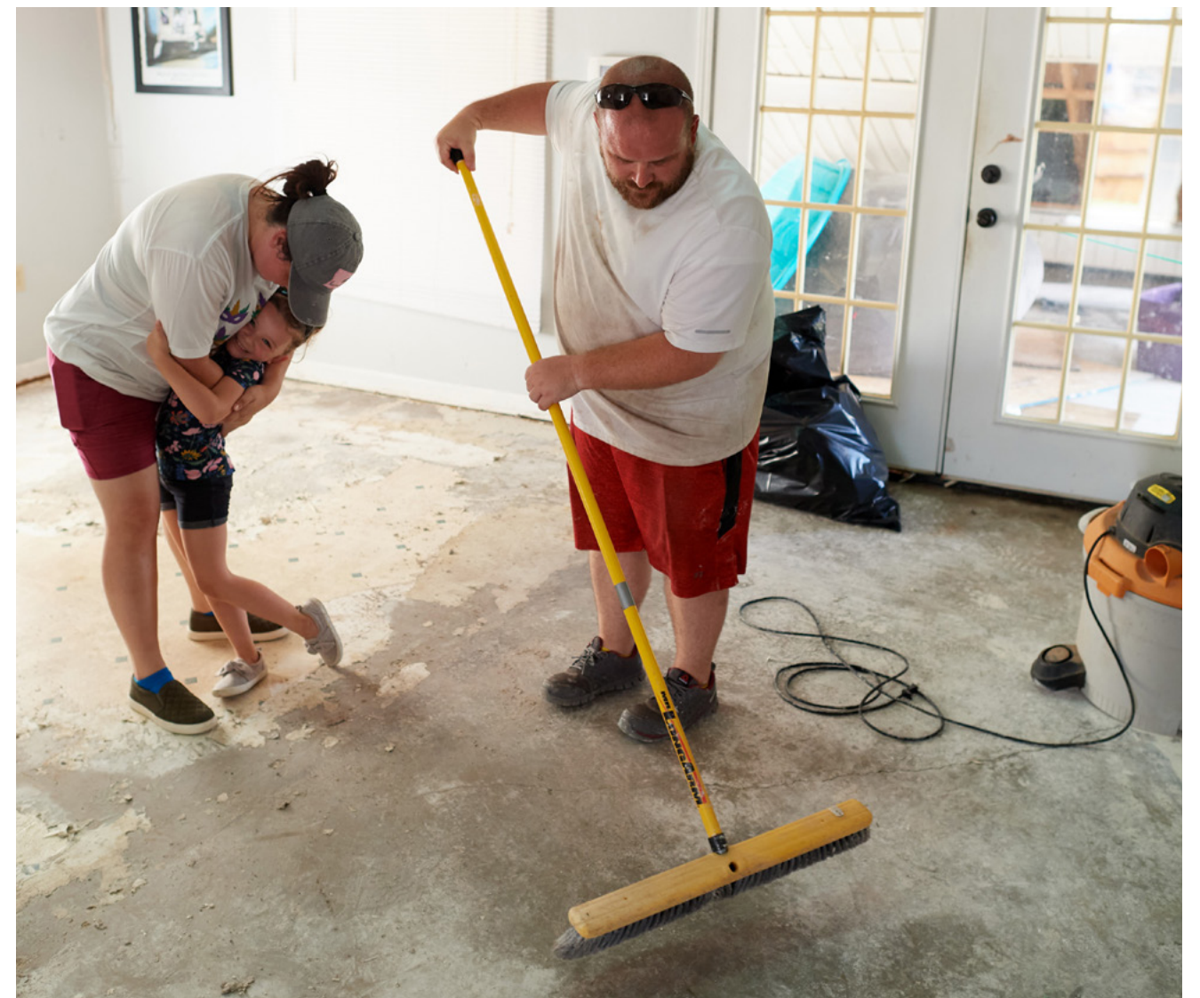
Above: Following Hurricane Ida, community volunteers, including members of The Church of Jesus Christ of Latter-day Saints, spent their Labor Day holiday weekend cleaning up.