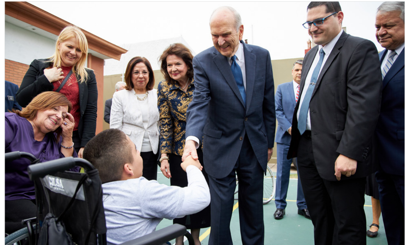
Above: During his Latin America ministry in 2019, President Russell M. Nelson attended a wheelchair distribution event in Argentina.

Cover Image: Young Church members work together on a community service project in Cusco, Peru.