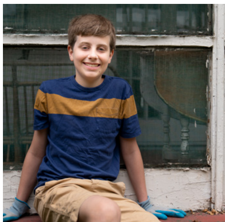
Top Left: Volunteers work alongside others to remove debris caused by Hurricane Ida at the First United Methodist Church in Hammond, Louisiana.