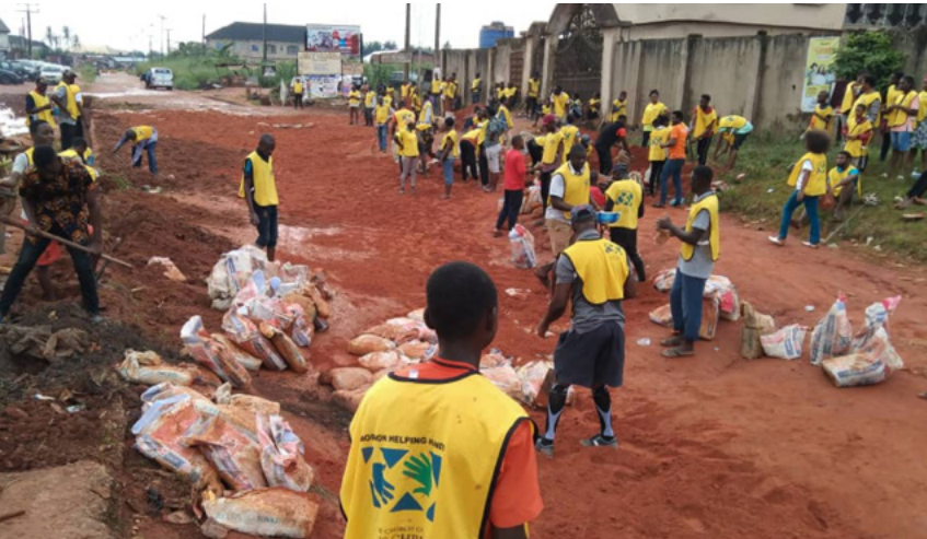
Above: Church members in Ghana organize to plant 15,000 seedlings for the 2021 All Africa Service Day.

IN BOLIVIA , the Relief Society sisters of the Los Andes Stake collected 34,000 plastic caps to support the Niño Feliz initiative, which helps low-income children with cancer receive chemotherapy treatments. And members of the Khovd branch in Mongolia visited their local Violence Victims’ Shelter to donate warm blankets, newborn supplies, and hygiene kits.