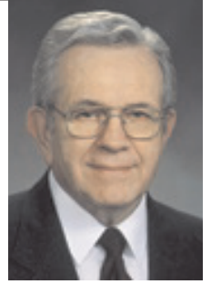
Ngumongameli Boyd K. Packer, uMongameli weKhoramu Labapostoli abayishumi Nambili