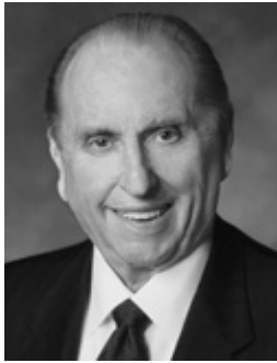
Otitenani Thomas S. Monson na otweresee