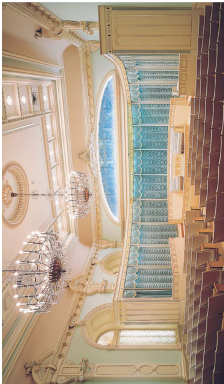
Terrestrial Ruum eo, Salt Lake Tappel