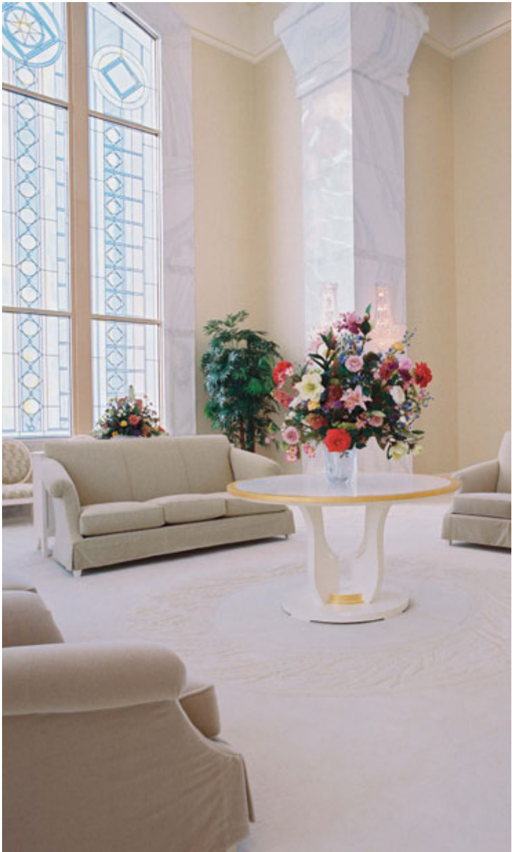
Celestial Ruum eo, Columbia River Wansington Tampej