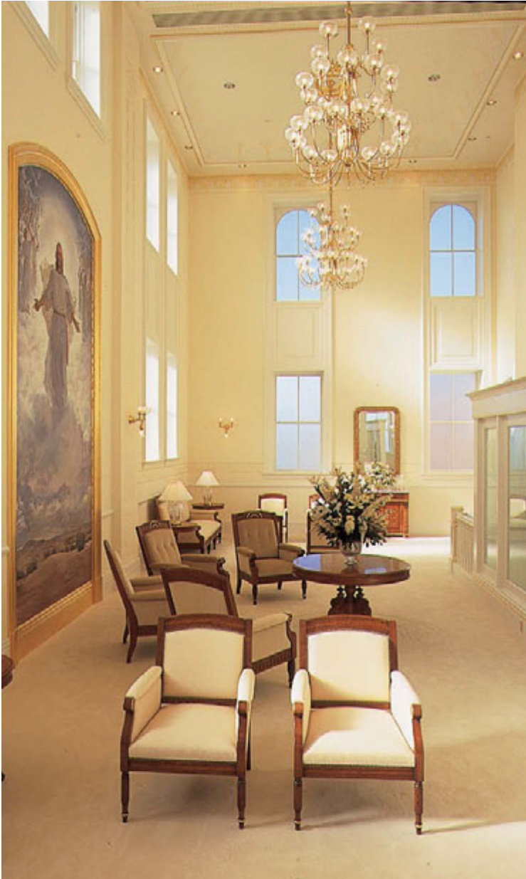
Celestial Ruum eo, Vernal Utah Tampej