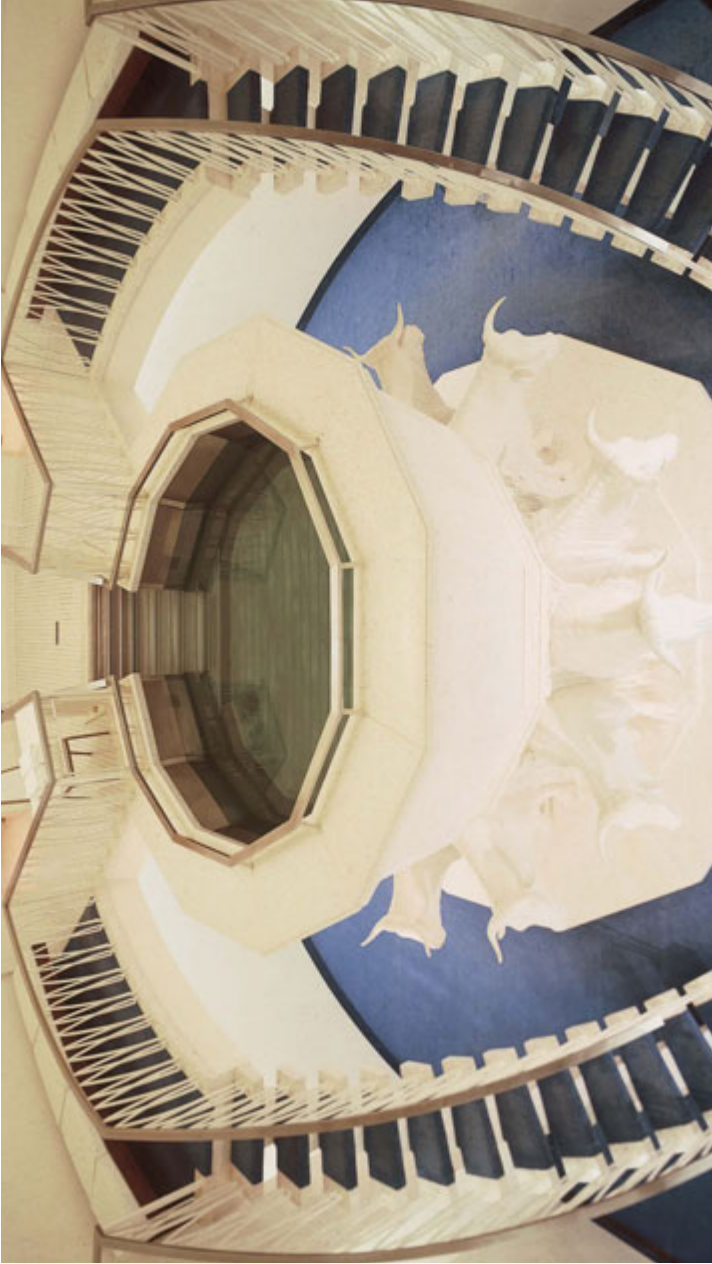
Jikin Peptaj eo, Washington D.C. Tampeļ