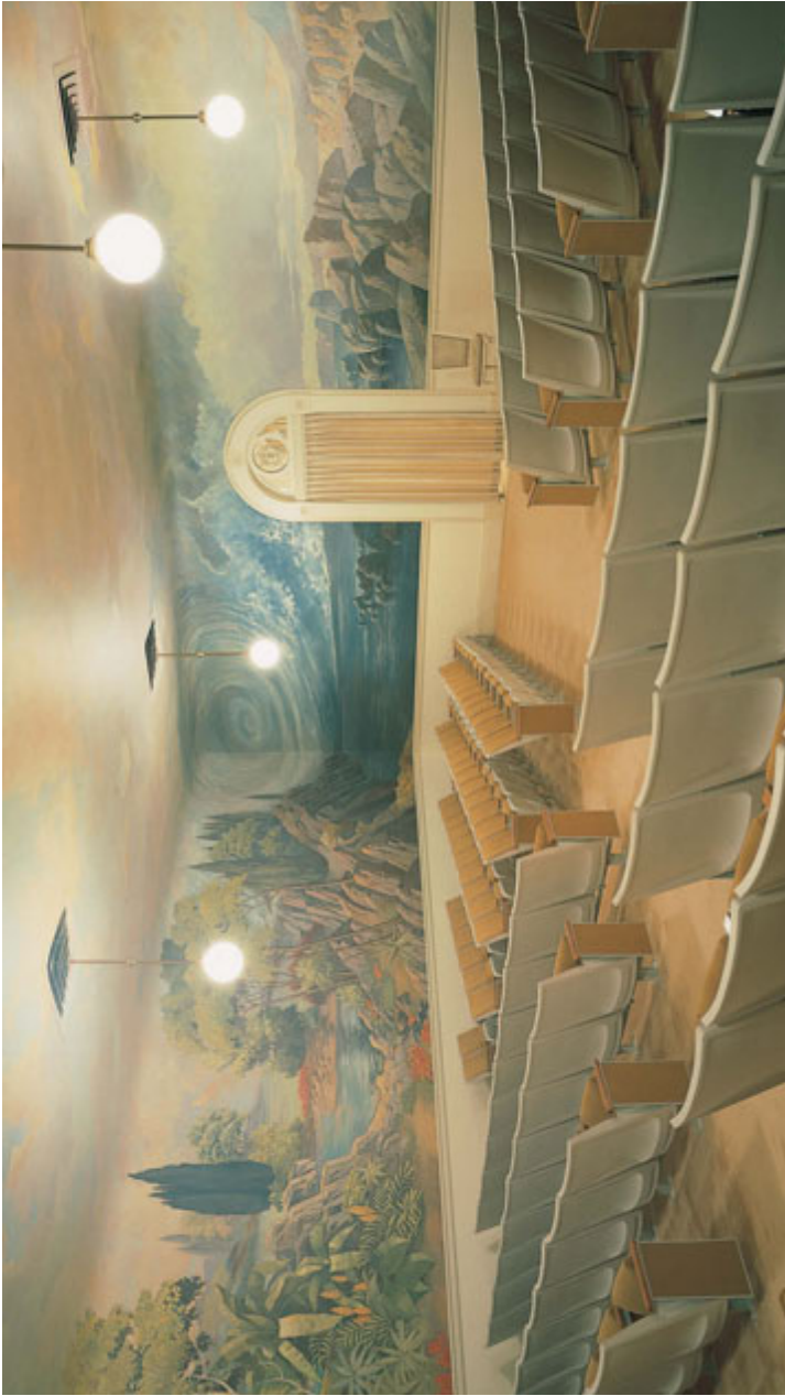
Creation Ruum eo, Salt Lake Tampeļ