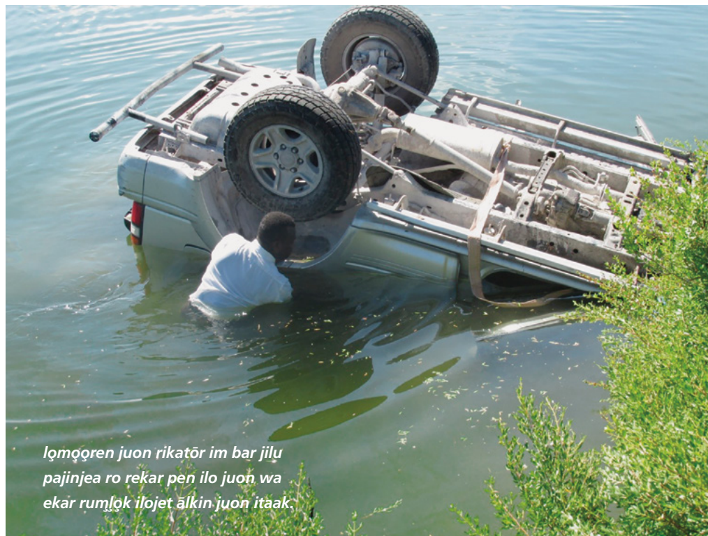
lōmṁoren juon rikātōr im bar jilu pajinjea ro rekar pen ilo juon wa ekar rumļok ilojet ālkin juon itaak.

Mijenede ro ruo raar kajju ettōrļok n̄an wa eo me ear tulok ilo dān eo im Elder Ulas ear deloņe ļwe eo ke elder