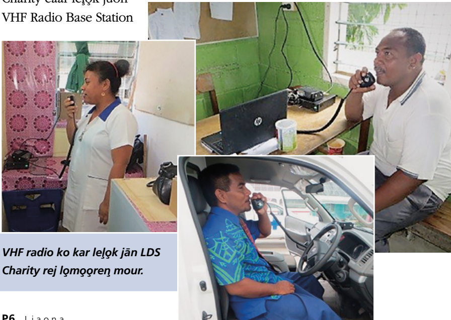
VHF radio ko kar leḷok jān LDS Charity rej lomogoren mour.