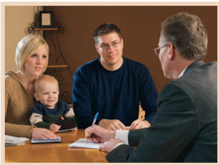
Pisap el ohsun nuh sin mempuhr ma enenuh ac sifil intoei lah fuhkah ohiyac wo se emet in sang kaksruh ac kaksrweles in sifacna kaksrweles.

Pisap an ahkinsewowoyeyuck ke mwe sang ke sulacnah wowo in etuh lah ohiyac fuhkah wo emet in kaksrweles suc enenuh kaksruh. Kais sie ohiyac luhn kais