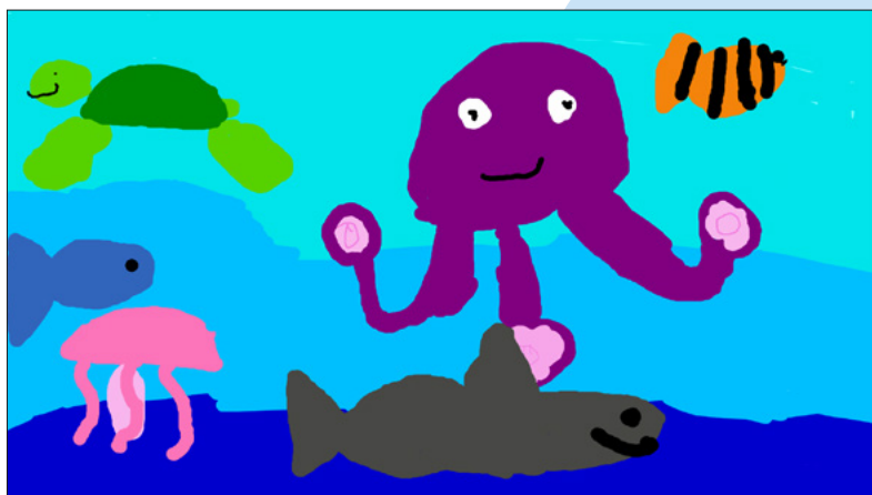
Philip W., age 8, Lancashire, England