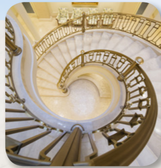
The spiral staircase in the Paris France Temple