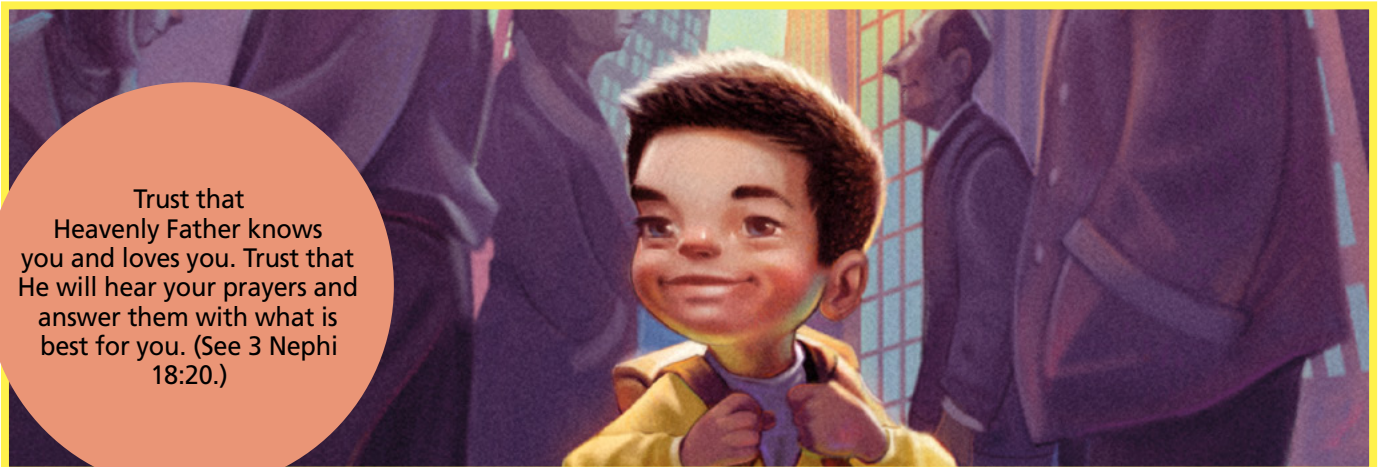
From "Faith in the Lord Jesus Christ," Ensign, May 1994, 98-100.

Trust that Heavenly Father knows you and loves you. Trust that He will hear your prayers and answer them with what is best for you. (See 3 Nephi 18:20.)