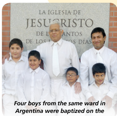
Four boys from the same ward in Argentina were baptized on the same day. Their bishop (center) stands with them.