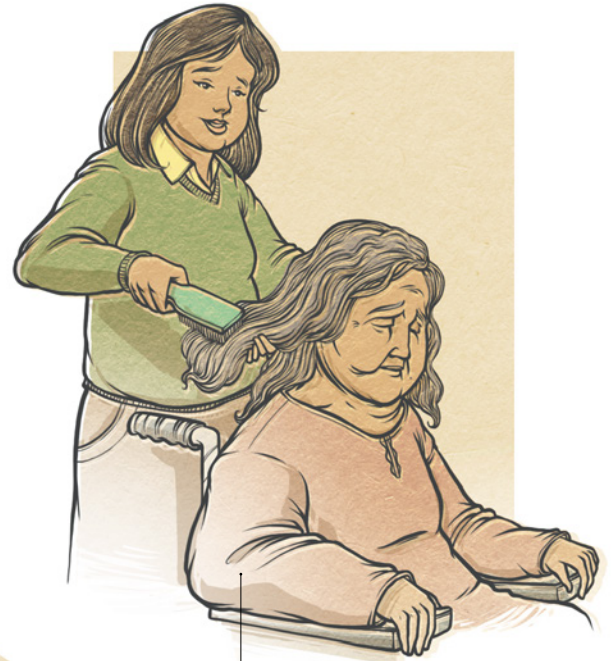
Giving selfless service.