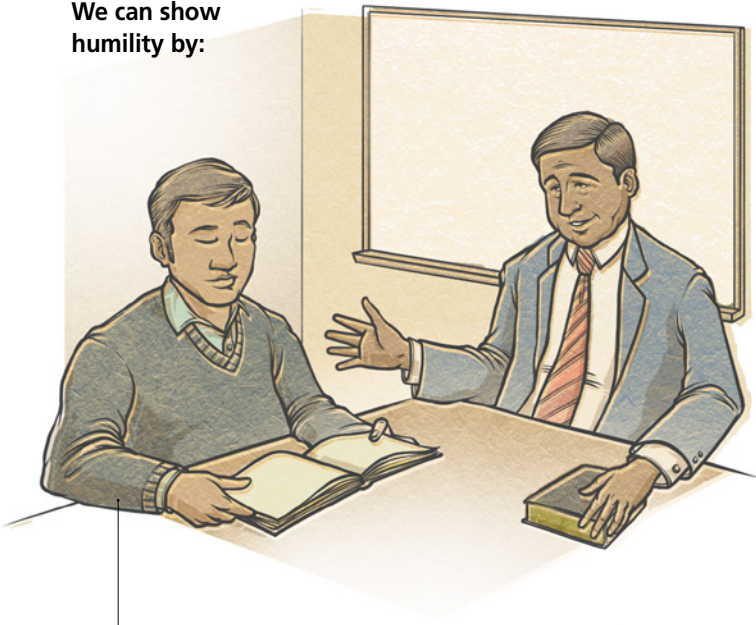
Receiving counsel and correction.