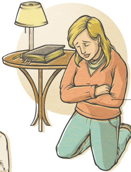
Praying with real intent.