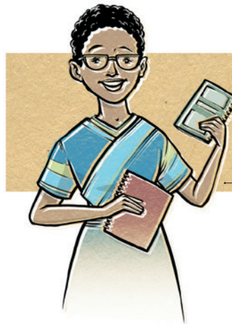
Tithing pays for the translation and publication of scriptures and lesson materials.