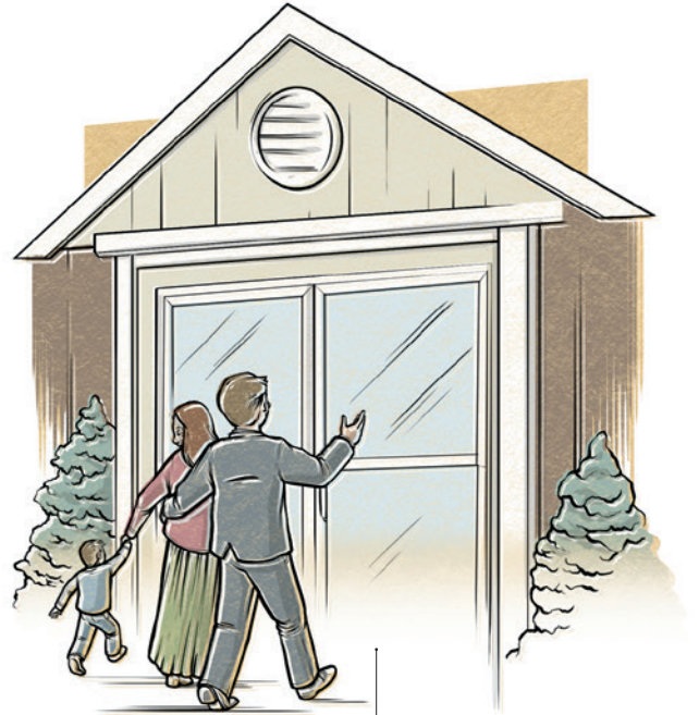
Tithing pays for the cost of building and maintaining temples and meetinghouses.