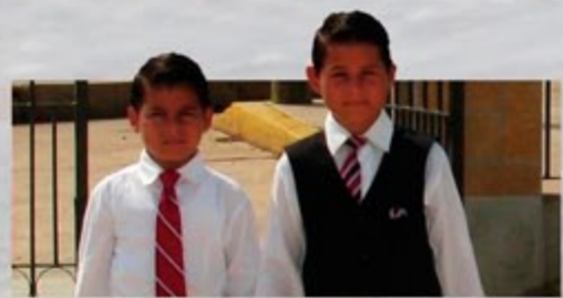
These brothers hope to live up to the names that their parents gave them. They want to be just like Mahonri and Helaman from the Book of Mormon.