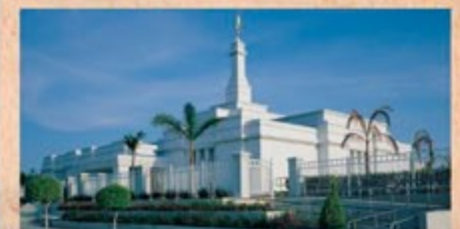
The Guadalajara Mexico Temple is the 11th of 13 temples in Mexico.