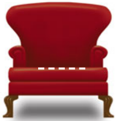
Robert D. Hales