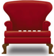
L. Tom Perry