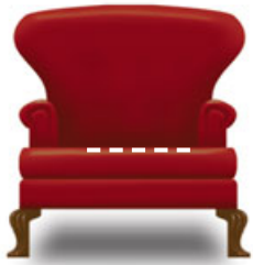
Jeffrey R. Holland