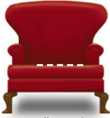
Russell M. Nelson