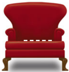
D. Todd Christofferson