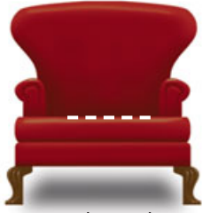
Boyd K. Packer