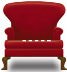
David A. Bednar