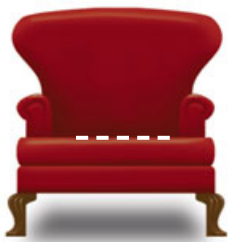
Henry B. Eyring First Counselor

When you watch general conference and one of these men gives a talk, you can move his picture from his chair to the podium.