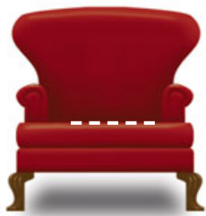
Thomas S. Monson President