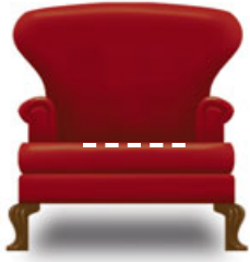
Dallin H. Oaks