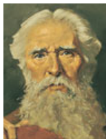
Moses Go down