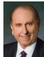
President Thomas S. Monson Go up