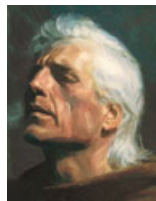
Moroni Go left