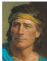
Mormon Go left