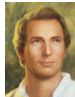
Joseph Smith Go up