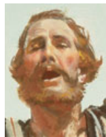
John the Baptist Go right