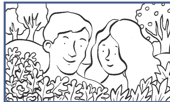
Then Heavenly Father placed Adam and Eve, our first parents, on the earth.