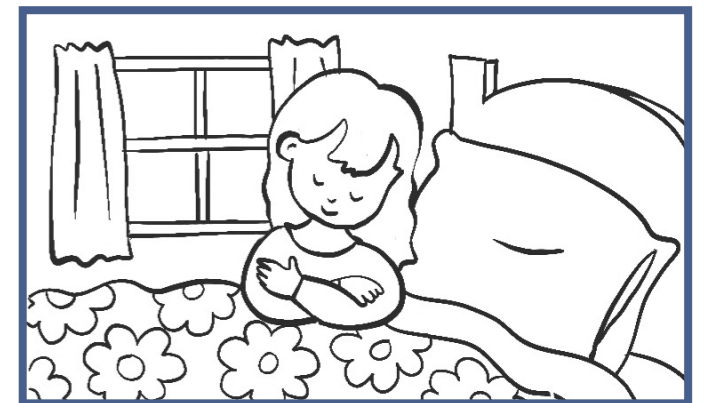
Heavenly Father loves me and watches over me.