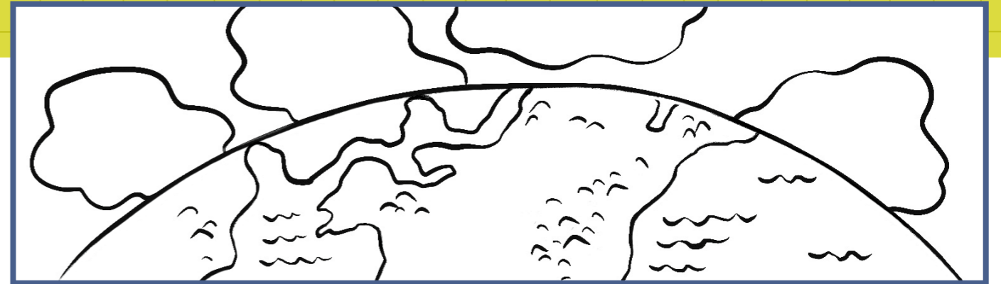
We lived with Heavenly Father before we were born. He asked Jesus Christ to create the world for us.

Color the pictures to learn more about Heavenly Father's plan. Read more in Abraham 3-5.