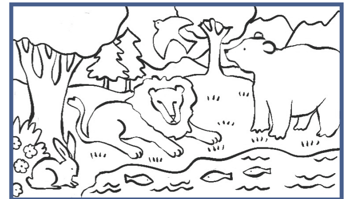
Jesus made the world beautiful with trees and flowers. He made fish, birds, and animals.