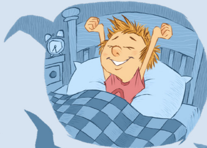
ILLUSTRATION BY GARTH BRUNER