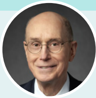
By President Henry B. Eyring Second Counselor in the First Presidency

Heavenly Father loves you. You are His child. He gave you Jesus Christ as your Savior. The Savior watches over you with love.