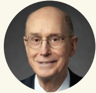
By President Henry B. Eyring Second Counselor in the First Presidency