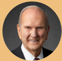
By President Russell M. Nelson