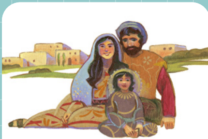
Jesus Christ was the son of Mary and Heavenly Father. Joseph was a wonderful stepdad.