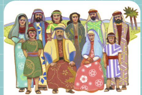
Lehi and Sariah had a large family. Their children didn't always get along.