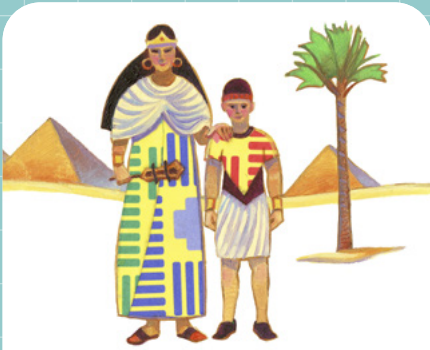
Moses was adopted by Pharaoh's daughter.

Not all families are the same. Here are some pictures of families in the scriptures. Draw your own family portrait in the empty box!