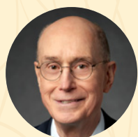
By President Henry B. Eyring Second Counselor in the First Presidency