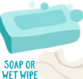
SOAP OR WET WIPE

9. A good man named Joseph took Jesus's body. "He wrapped it in a clean linen cloth, and laid it in his own new tomb, which he had hewn out in the rock." (See Matthew 27:57-60.)