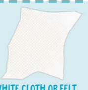
WHITE CLOTH OR FELT

3. The chief priests took Jesus and tied Him up. "And when they had bound him, they led him away, and delivered him to Pontius Pilate the governor." (See Matthew 27:1-2.)