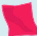
RED FABRIC OR FELT

10. "And he rolled a great stone to the door of the sepulchre, and departed" (Matthew 27:60). Pilate told the guards to watch the tomb to make sure no one moved the stone.