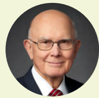
By President Dallin H. Oaks First Counselor in the First Presidency

Here are some of the ways we can hear Him: