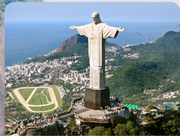
A giant statue of Jesus Christ stands on a mountaintop near the city of Rio de Janeiro.

Brazil is the largest country in South America. More than a million members of the Church live there.