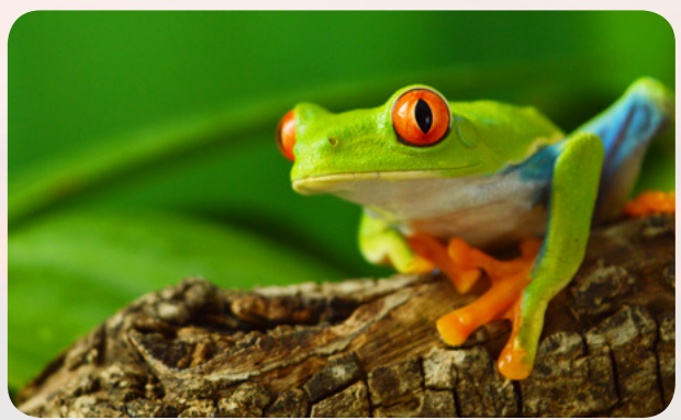
The Amazon River is the longest river in the world. And the Amazon rainforest is the biggest rainforest in the world! It's home to many amazing animals, like this red-eyed tree frog.