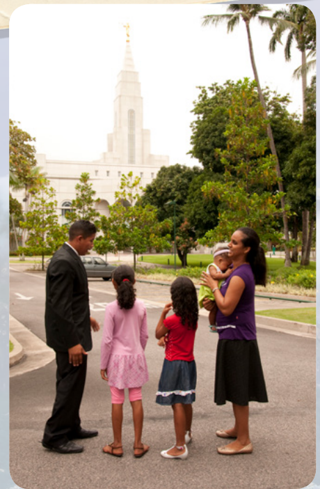
Soon there will be 11 temples in Brazil! On page 10, you can read about a Brazilian boy's first temple trip.