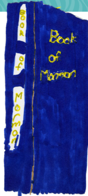
Owen H., age 9, Arizona, USA