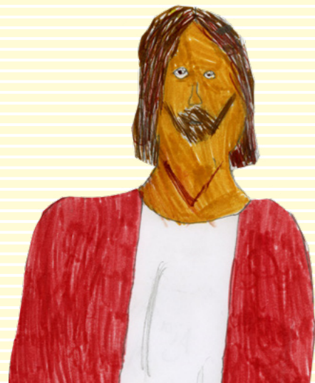
Aja S., age 8, Queensland, Australia