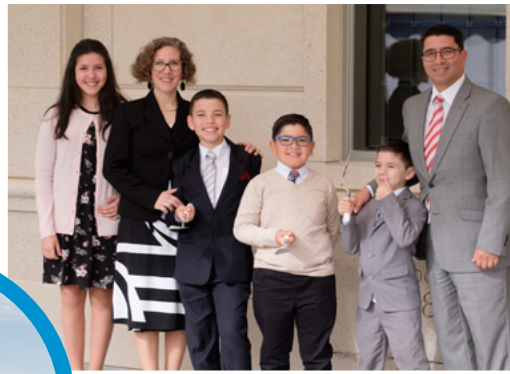
Children came with their parents to hear President Nelson give a special prayer to dedicate the temple.