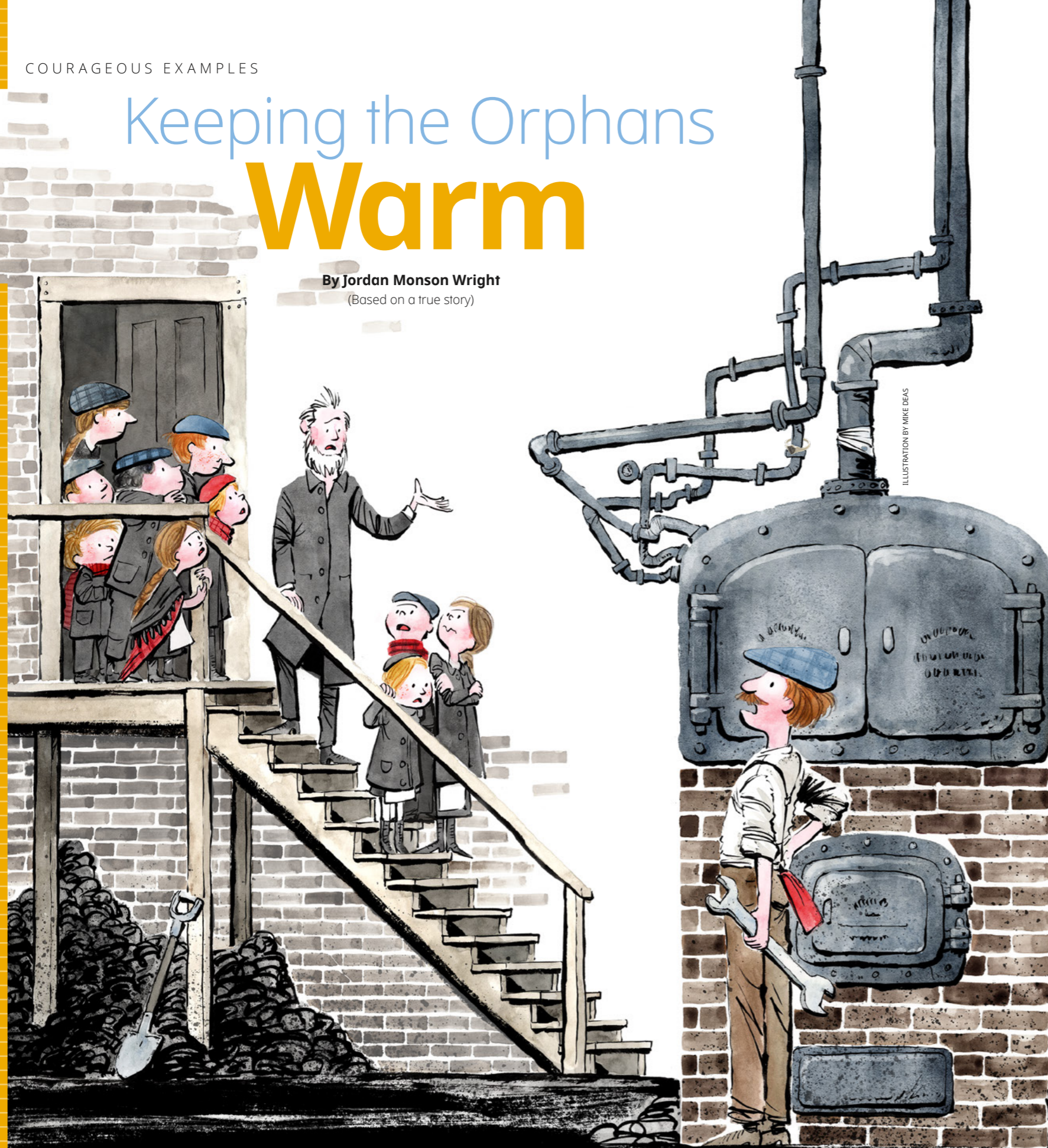
ILLUSTRATION BY MIKE DEAS