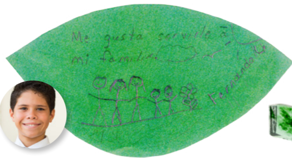
Montana F., age 9, Washington, USA