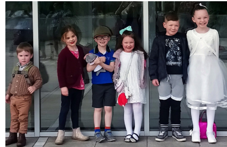
Primary children in Staffordshire, England , visited the Preston England Temple on a stake temple day. They had fun exploring the temple grounds and learning more about the temple.

When I go to church I feel the Spirit strongly. I know God loves me.