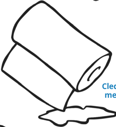
Clean up messes