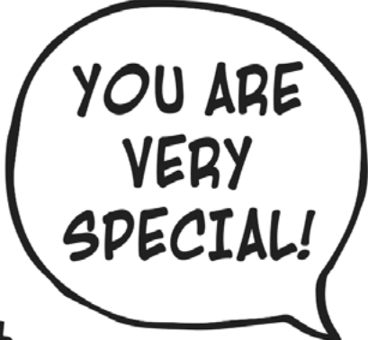
Use kind words