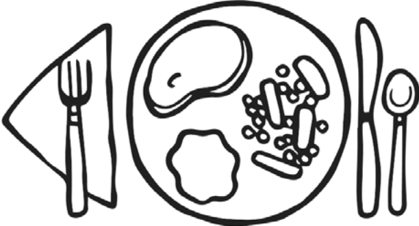
Help make a meal