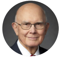
By President Dallin H. Oaks First Counselor in the First Presidency