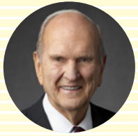
By President Russell M. Nelson