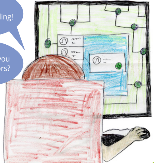
Sara I., age 8, Virginia, USA