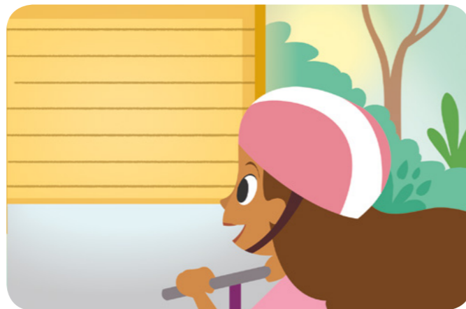
Lelah races back up the driveway. Obeying the family rule gives her a happy feeling!