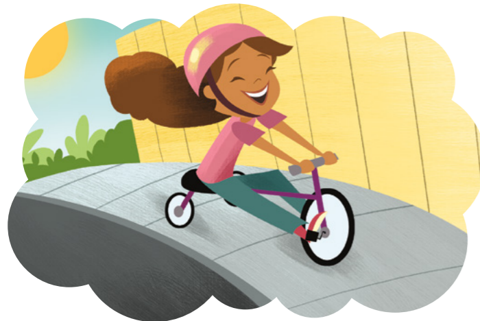
But Lelah wants to race down the sidewalk!