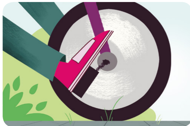
Her front tire rolls closer to the end of the driveway.