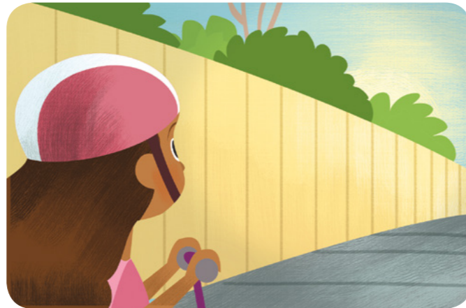
She is supposed to stay on the driveway. It's a family rule.