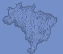
Elder Ulisses Soares Of the Quorum of the Twelve Apostles

Check your answers on lds.org/prophets-and-apostles .