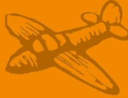
Elder Dieter F. Uchtdorf Of the Quorum of the Twelve Apostles