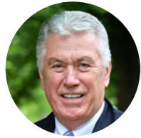
By President Dieter F. Uchtdorf Second Counselor in the First Presidency