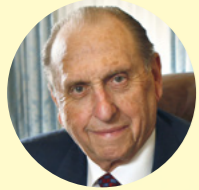
By President Thomas S. Monson