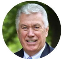
By President Dieter F. Uchtdorf Second Counselor in the First Presidency