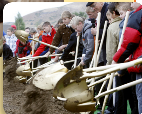
At the groundbreaking, Elder Dallin H. Oaks invited all of the new deacons to come up and break the soil.

Join us each month to see how the Payson Utah Temple was built!