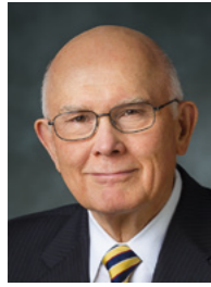
From Elder Dallin H. Oaks Of the Quorum of the Twelve Apostles