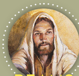
ILLUSTRATION BY JIM MADSEN

Adapted from "Lord, Is It I?" Ensign, Nov. 2014, 56–59.