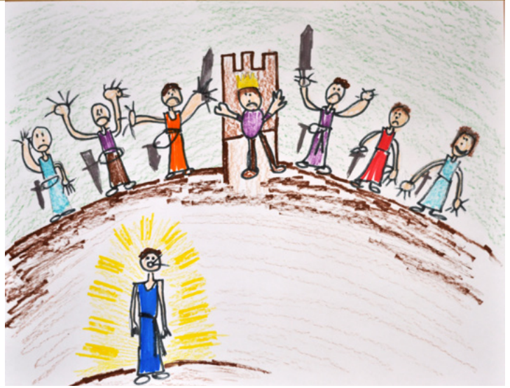
Brooks L., age 8, Florida, USA