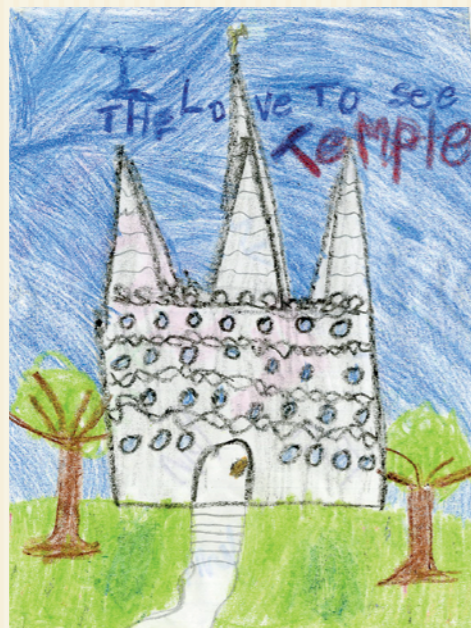
Emeline D., age 8, England