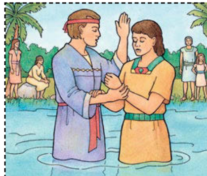
Samuel the Lamanite Helaman 13–14, 16