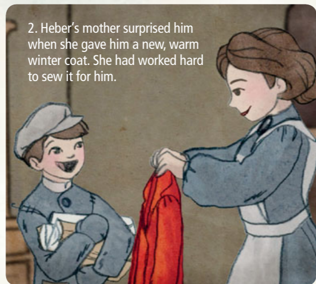
2. Heber's mother surprised him when she gave him a new, warm winter coat. She had worked hard to sew it for him.