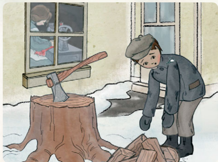
1. Young Heber J. Grant worked hard in his thin, worn jacket. His family was poor and didn't have money to buy a new coat.