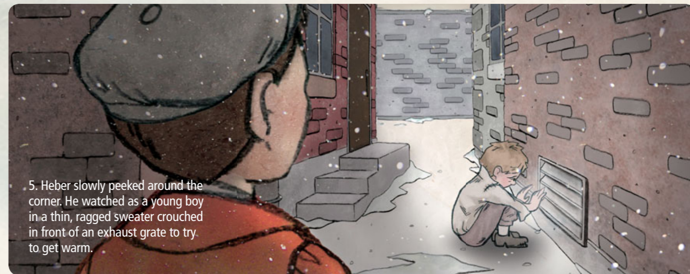
5. Heber slowly peeked around the corner. He watched as a young boy in a thin, ragged sweater crouched in front of an exhaust grate to try to get warm.