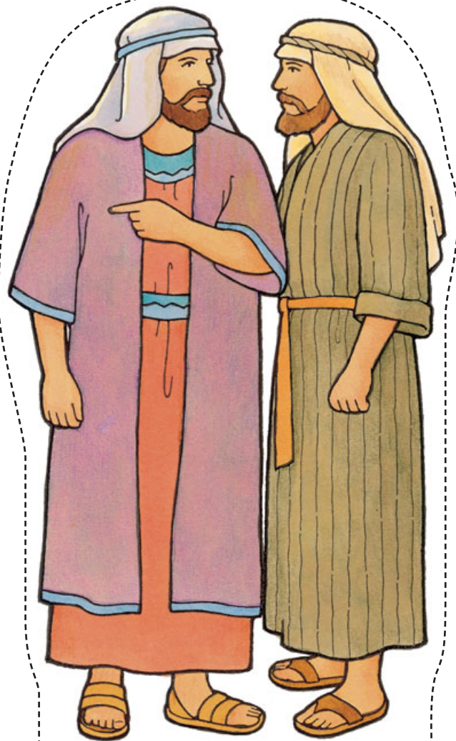
Laman and Lemuel